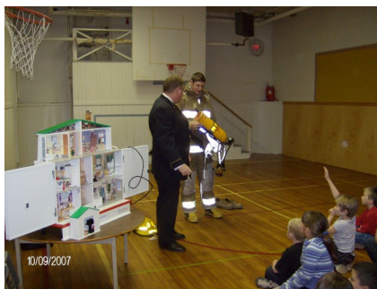
10/09/2007 Fire prevention education at Alice Street Elementary School