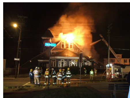
Old Immanuel Baptist Church Fire - 651 Prince Street

The Brigade responded to more Lifeflight landings than ever before with EHS requesting that we