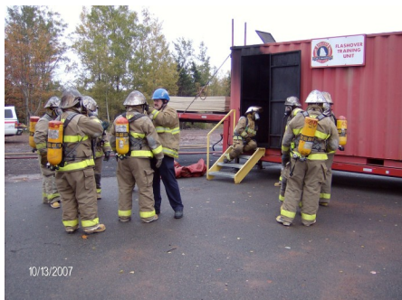
Flashover Training with the HRM Fire Service

Several guest speakers were used throughout